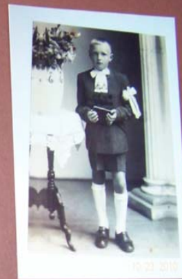
A boy in 1944 (he is 74 now!)