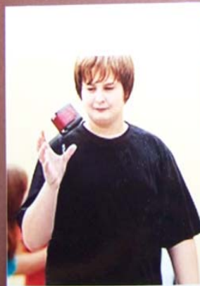
And a boy in 2010