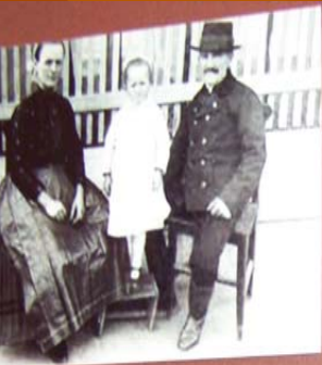
How did we live? in 1940s