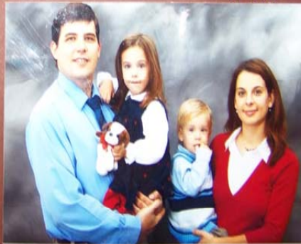
How do we live now? in 2010